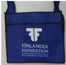
Tote bag 16" x 14" Blue