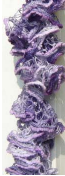
14. Blue & Purple